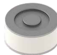
\Phi 16.0 \times 4.6\text{mm}